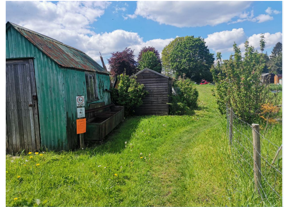
Photo of existing footpath along southern boundary to the allotments