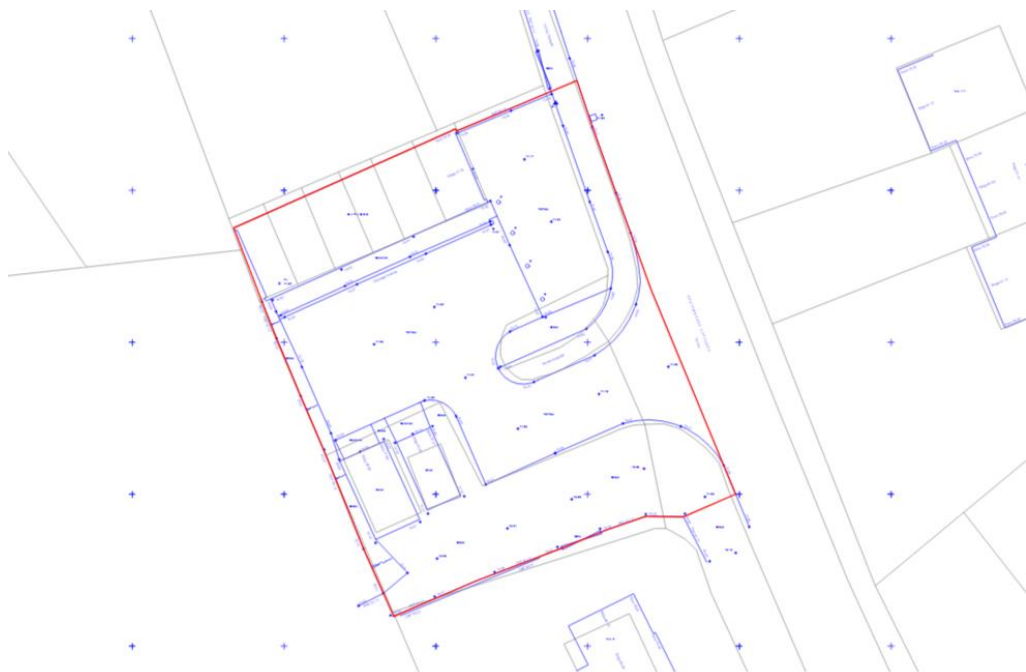
Existing site plan