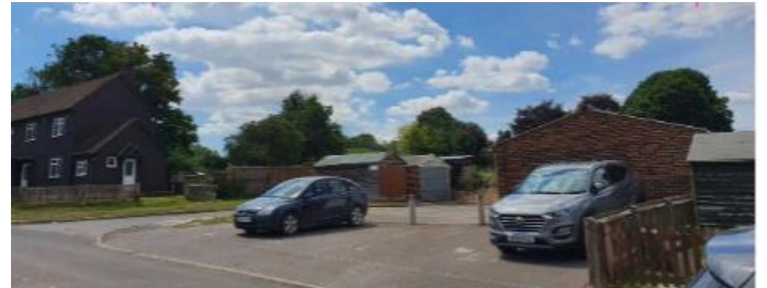
Existing garages/parking on site