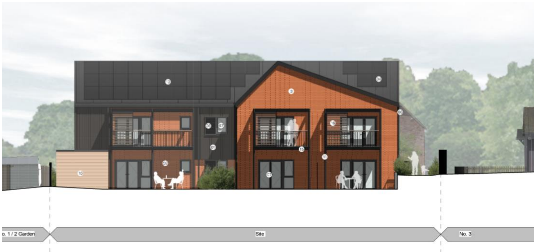
Proposed West (Rear) Elevation