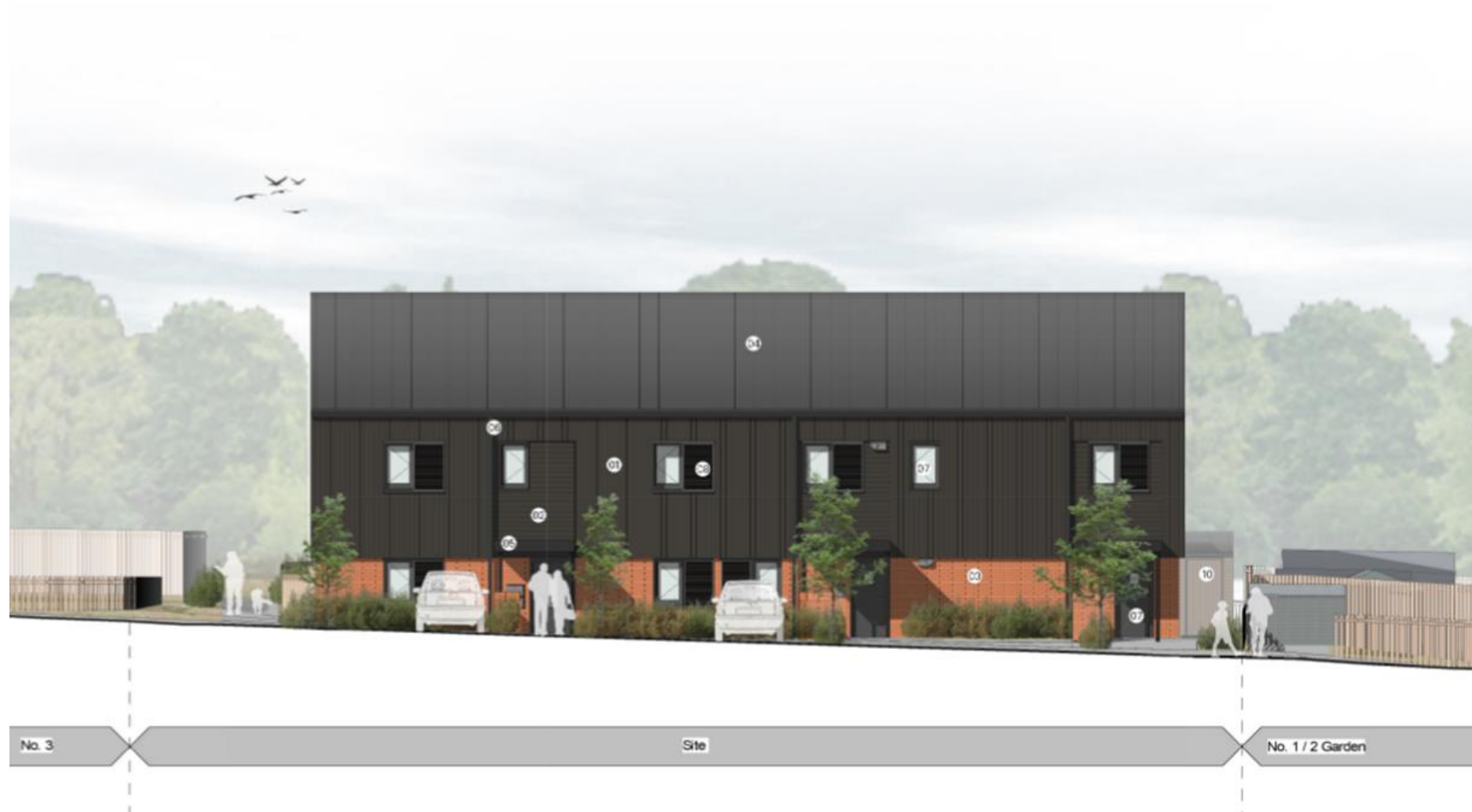
Proposed Eastern (Front) Elevation