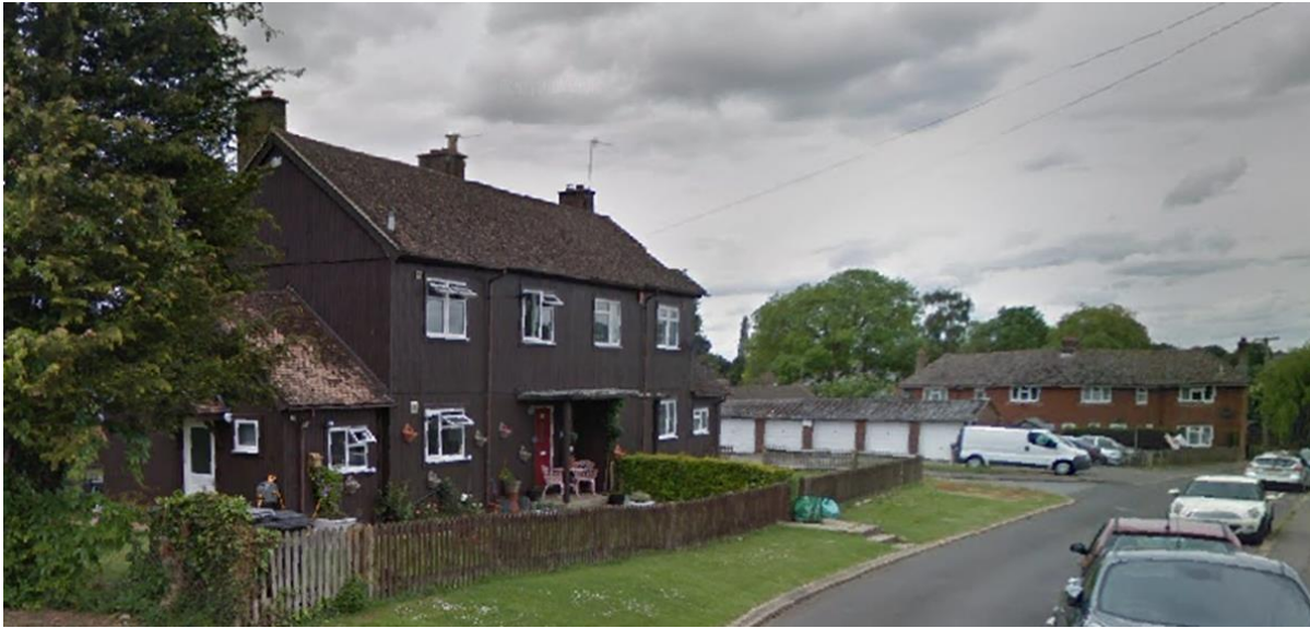
Photo looking back at application site