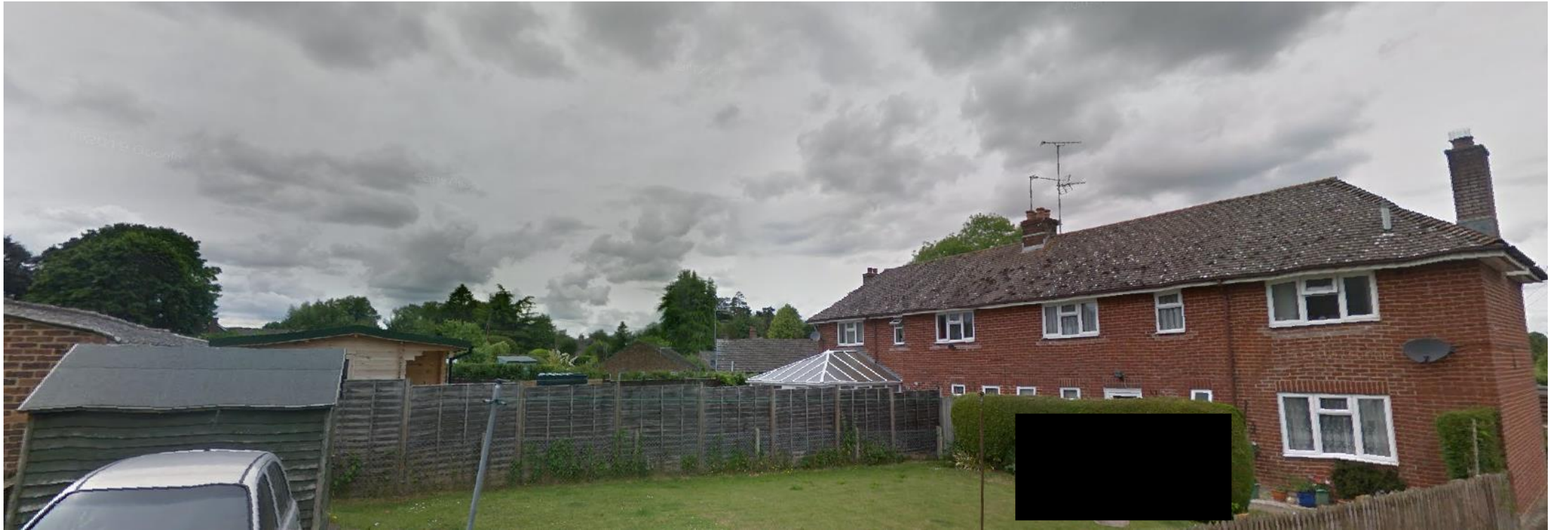
Photo of Numbers 1 and 2 Southbrook Cottages