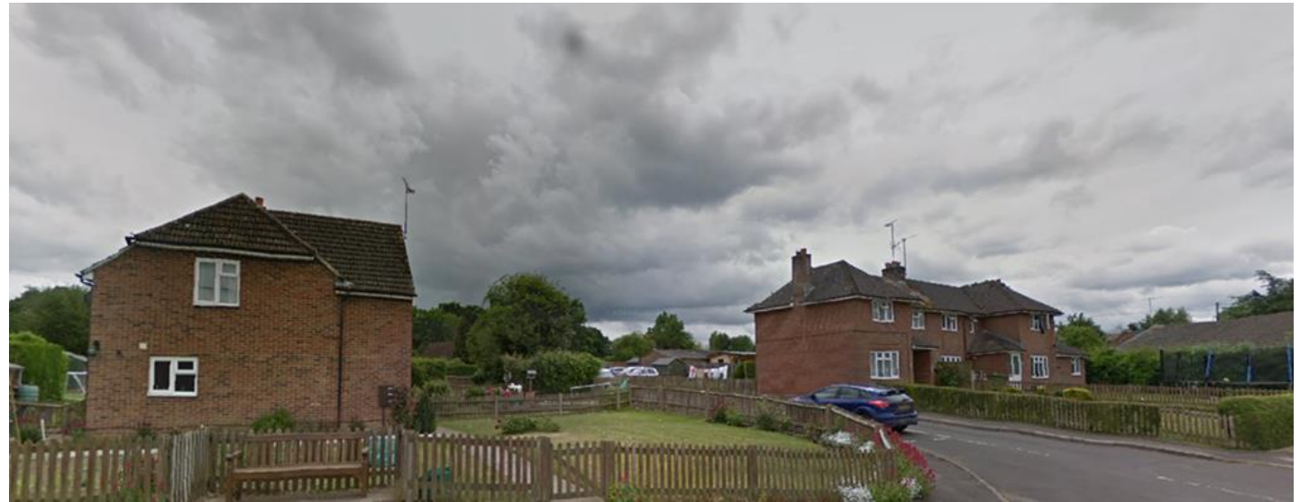
Photo from Duke Street looking towards application site