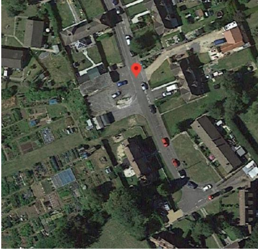
Satellite image of site