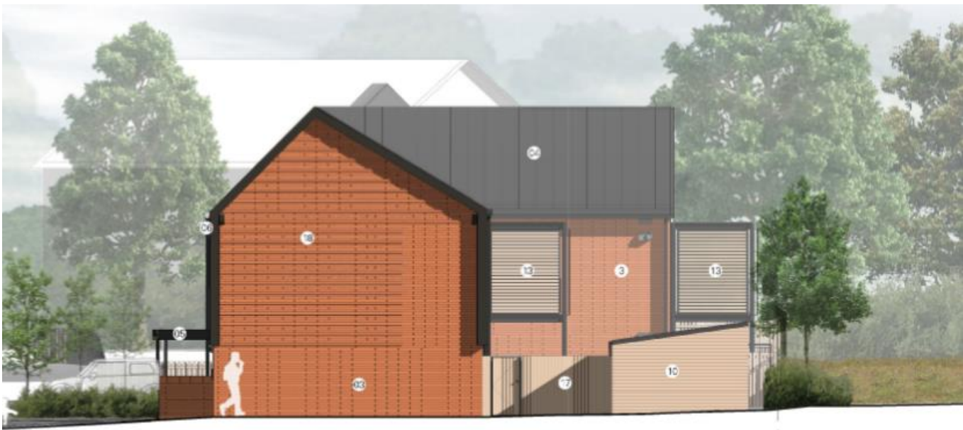
Proposed North Elevation