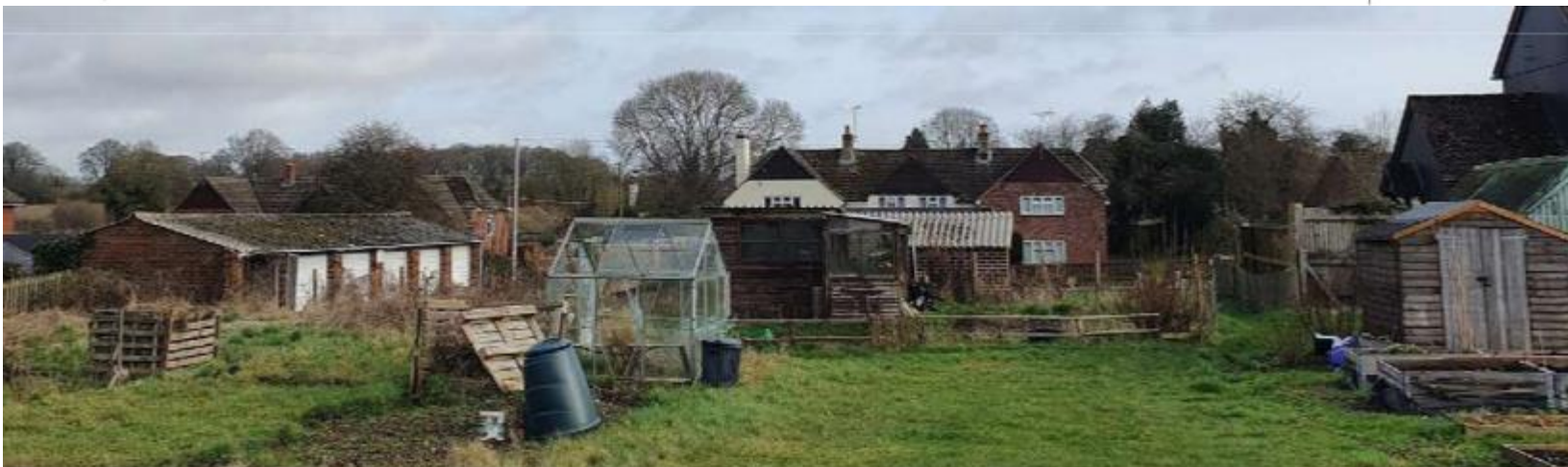
View of site from the allotments to the west