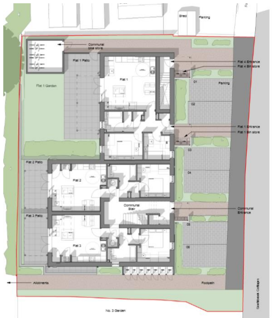
Proposed Ground Floor Plan