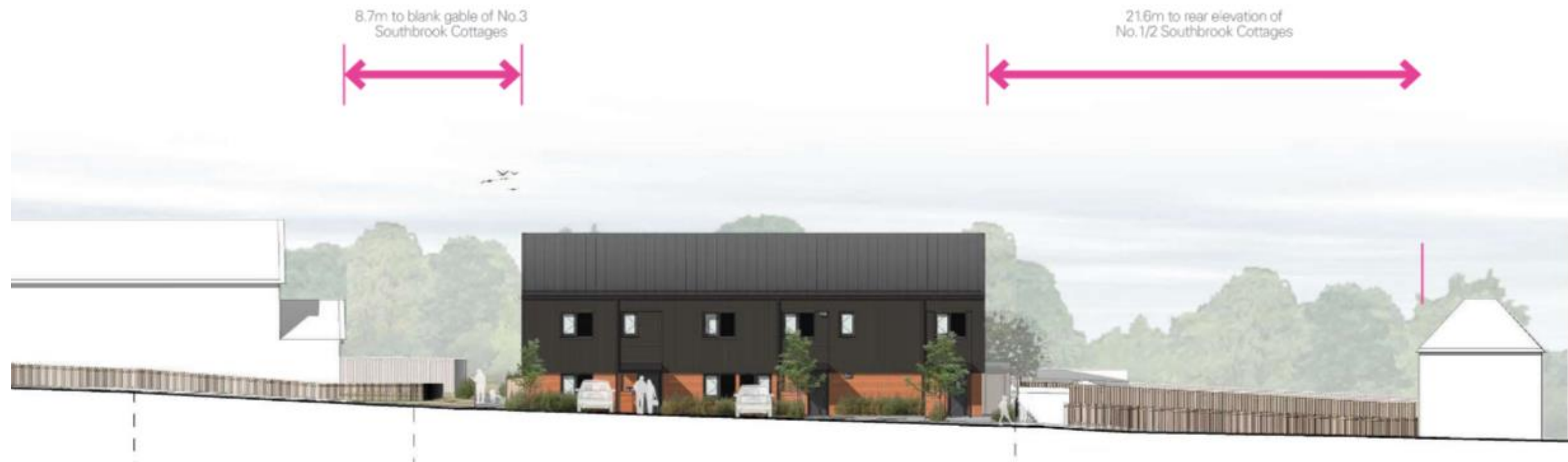
Proposed Site Sections/Street Scene