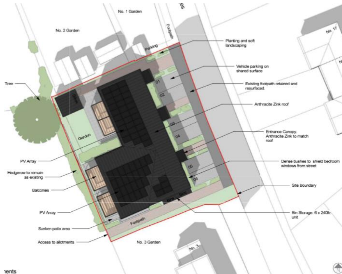
Proposed Site Plan