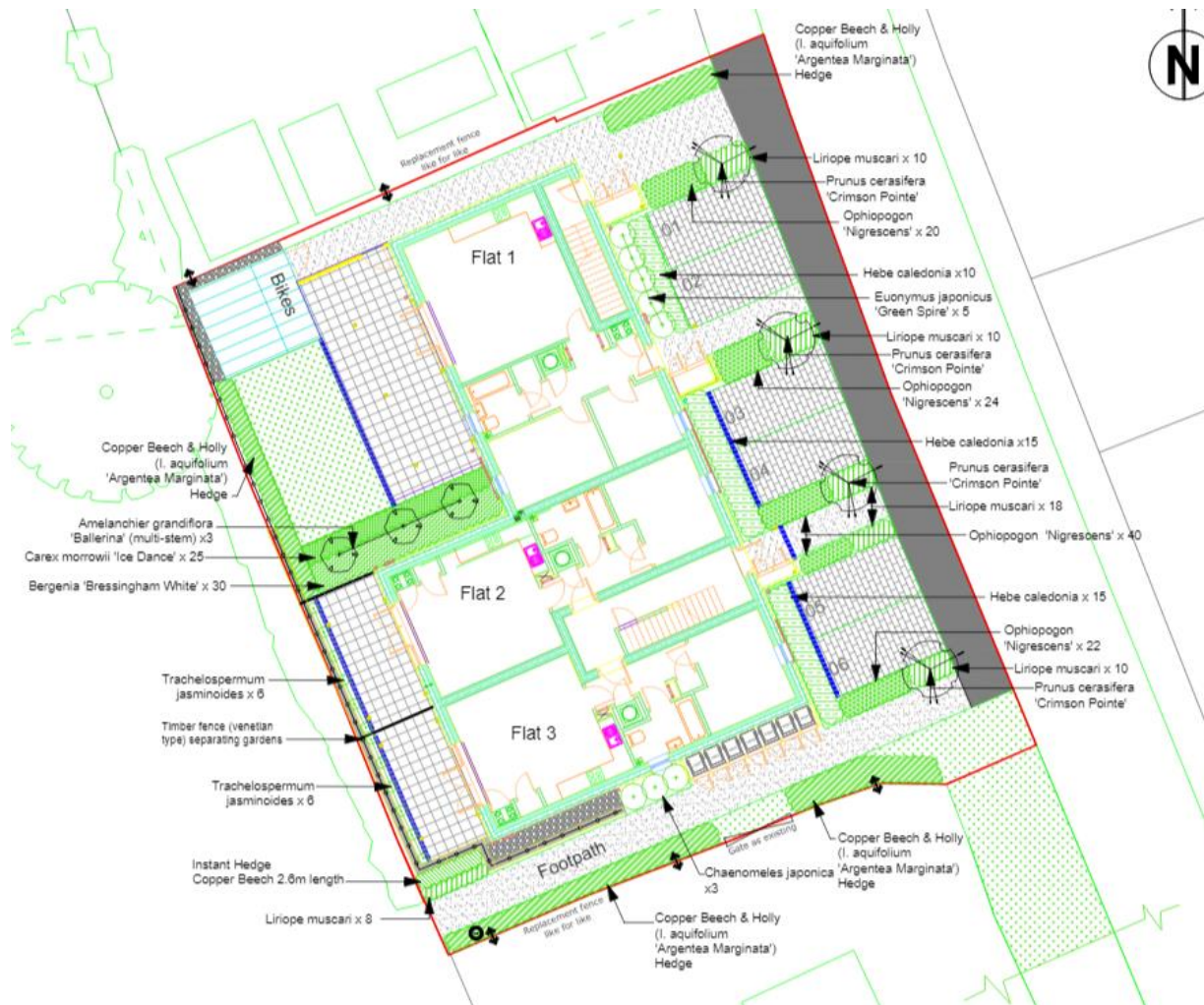
Proposed Landscaping Plan